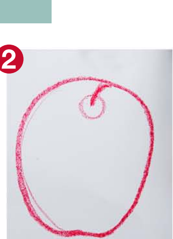
Sketch the apple with an oil pastel.