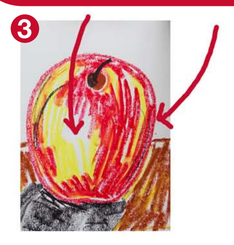
Color it in. It does not have to be perfect. In fact, it should not be perfect. Just use all the colors you see in the apple and leave small gaps between them.

Use some brown or little bit of black for the 'shadow' part of an apple.